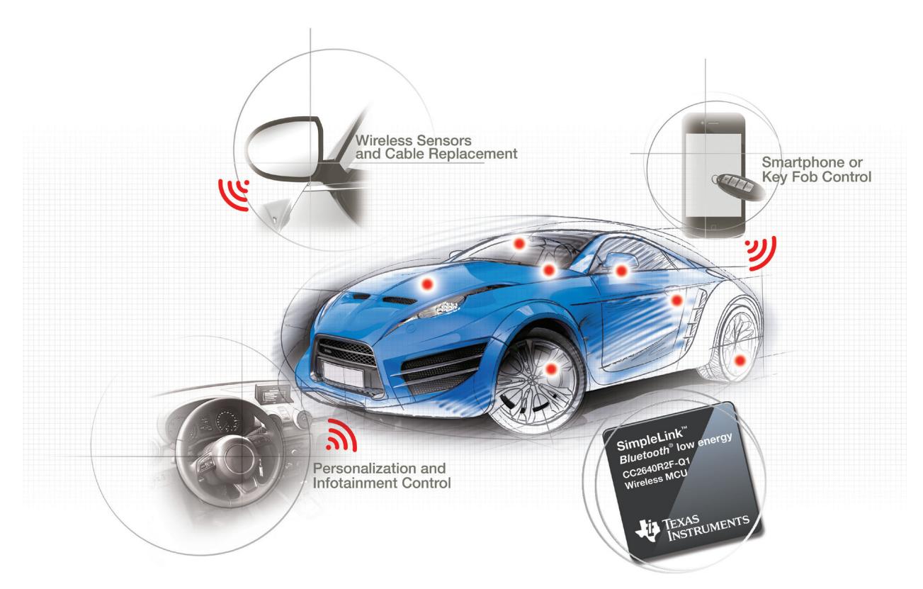
Figure 1. Bluetooth low energy-enabled applications as part of the automotive transformation.

One of the latest developments in the midst of this transformation is automotive original equipment manufacturers' (OEMs) embrace of Bluetooth low energy technology (Figure 1) because of its technical merits and embedded presence in smartphones. The intent is to enable consumers to use their Bluetooth low energy-equipped smartphones and portable devices to manage applications revolving around in-vehicle control, personalized infotainment, vehicle diagnostics, car access, vehicle sharing and piloted parking. As the industry also evolves to be greener, replacing cables using low-power wireless technology is another major potential for Bluetooth low energy.